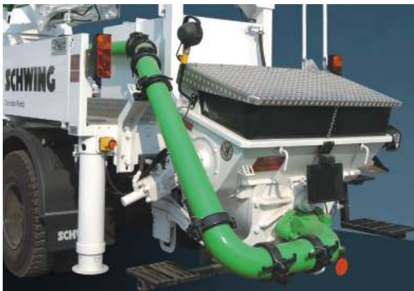
Rock Valve system

Thanks to it's lightweight superstructure and modular design it is possible to mount on a 16 Ton truck that fulfills most of our customer's needs. The compact size of this boom truck makes it usable under bridges, on barges, inside excavation and dam sites. It is the ultimate 'Urban Machine' which can be used to pump many residential jobs with minimum set up time.