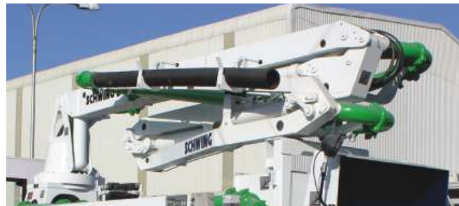
The combined RZ fold