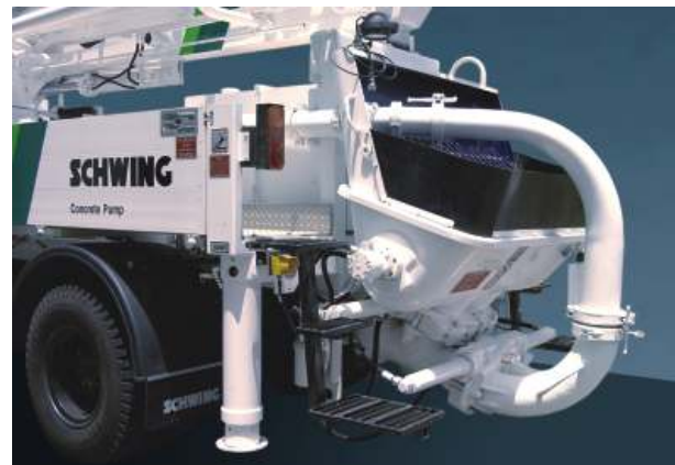
Gate Valve system

The delivery system has options of Flat gate valve / Rock valve system. Flat gate valve is known for its success with tough concrete and Rock valve is known for its pumping characteristics, low wear behavior, rebuilding qualities and safety.