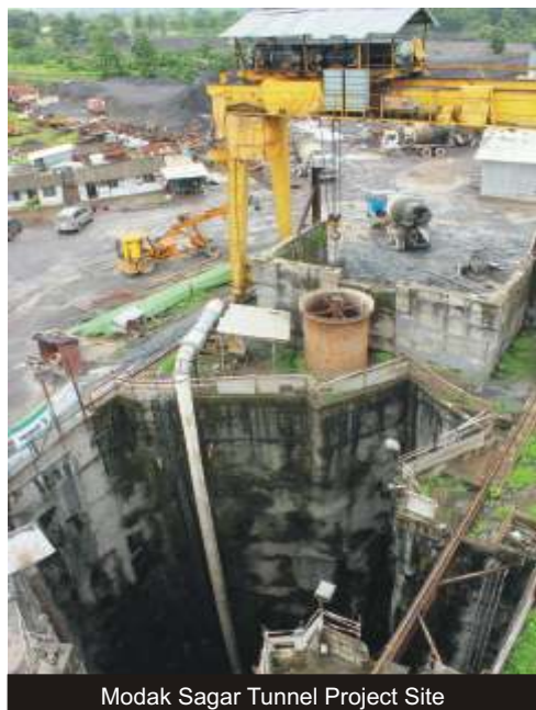
Modak Sagar Tunnel Project Site

Our company has delivered many residential and commercial projects till date. While every project has been created with equal interest and dedication, there are some projects known for their innovation which has made them a landmark projects. Some of the recent landmark projects are Delhi Metrorail Project and Modak Sagar Project. In Delhi Metro Rail project, we are doing 30 km of construction with 11 underground stations.