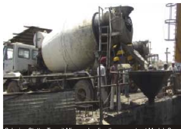
Schwing Stetter Transit Mixer unloading the concrete at Modak Sagar