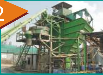
Project in Progress